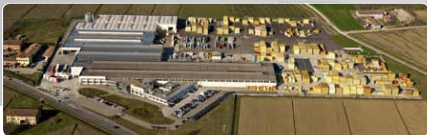
HEADQUARTERS DUNA CORRADINI Spa (Soliera - Italy)

HEADQUARTERS DUNA CORRADINI spa (Soliera - Italy)