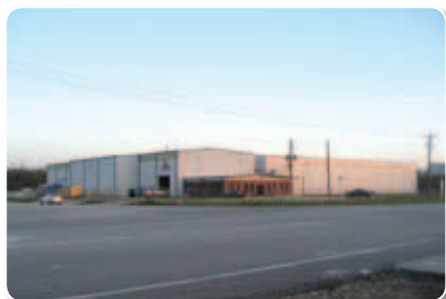
DUNA-USA INC (Baytown, Houston - USA)