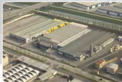
STIFERITE SRL (Padova - Italy)