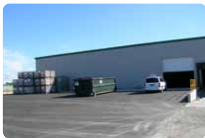
DUNA-USA INC (Ludington, Michigan - USA)